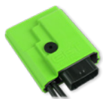
ECU RX1 PRO 2018