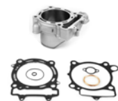
EASY CYLINDER KIT 2016-2018