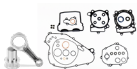
EASY ROD KIT 2016-18