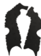
VIBRAM FRAME GRIPS (18/19)