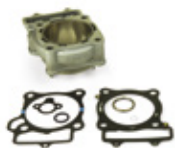
EASY CYLINDER KIT (18/19)